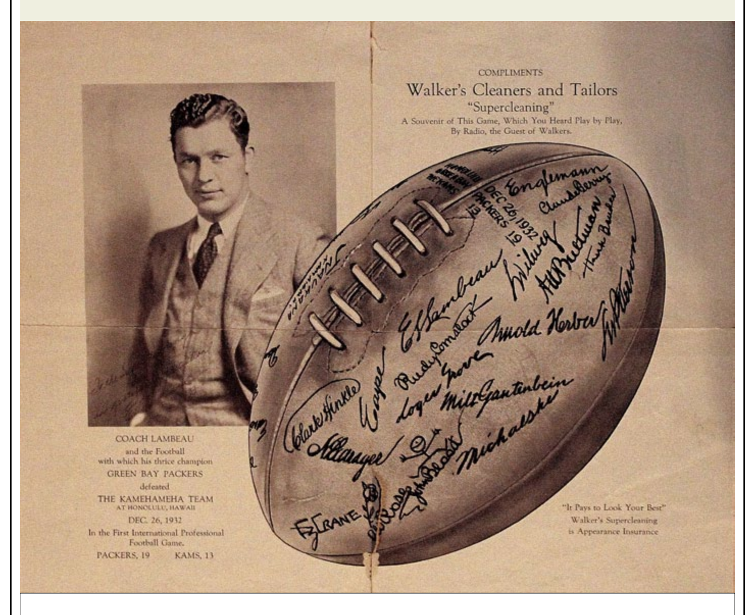
Newly discovered Packers Walker's Cleaners piece.

premium commemorates a game played on December 26th, 1932, between the Packers and the Kamehameha Kams in Honolulu, Hawaii. The Walker's brand is prominently displayed as well as their sponsorship of a radio broadcast of the game. The central focus of the piece is a large football with facsimile signatures of Pack-